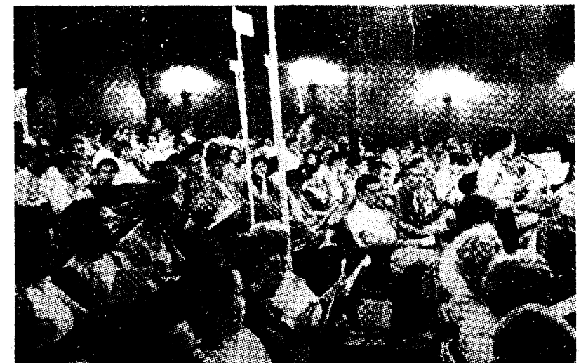
At plenary sessions of the NSA Congress resolutions on student rights, birth control and civil liberties were debated.

ident rights, and national secur-lification. The College's delegation voted with the majority. It was during debate on "The